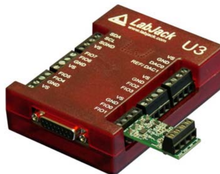
Figure 2: LJTick-DAC With U3

The pins shown on the right side of the LJTDAC (Figure 1) connect to the LabJack. The VS/GND pins power the LJTDAC, while the DIOA/DIOB pins are used for digital communication (I 2 C) between the LJTDAC and LabJack. DIOA is the serial clock (SCL) and DIOB is the serial data (SDA). Following are descriptions of the screw-terminal connections: